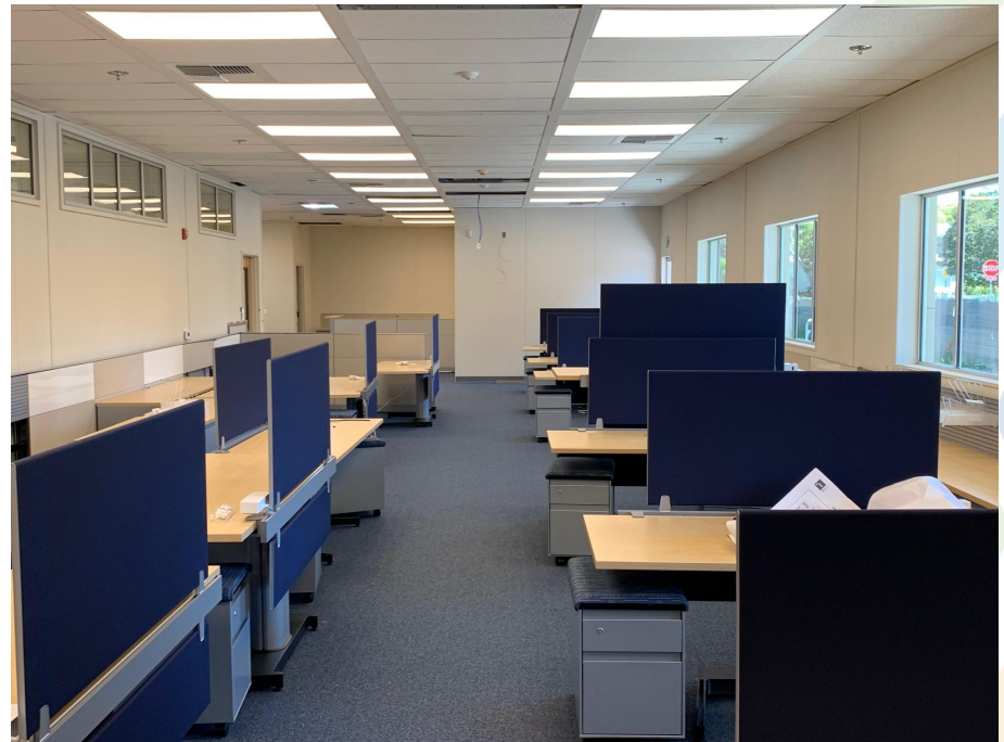
Mountain View Whisman School District