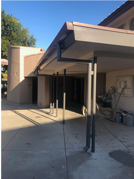
Mountain View Whisman School District