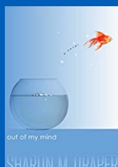
Out of My Mind by Sharon M. Draper Grades 3-5