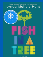
Fish In a Tree by Lynda Mullaly Hunt Grades 6-8